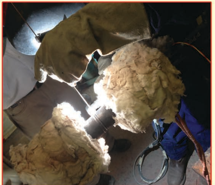
COPPER PIPE WELDING